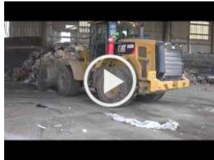
Republic Services Small Business of the Year (51+ Employees)