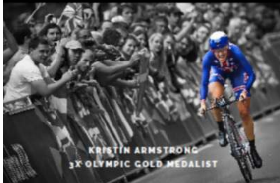
KRISTIN ARMSTRONG 3X OLYMPIC GOLD MEDALIST

TUESDAY | JUNE 11 | 11:30 AM 808 S VANGUARD WAY | MERIDIAN ID