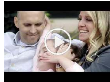
The Village at Meridian Philanthropic Business of the Year