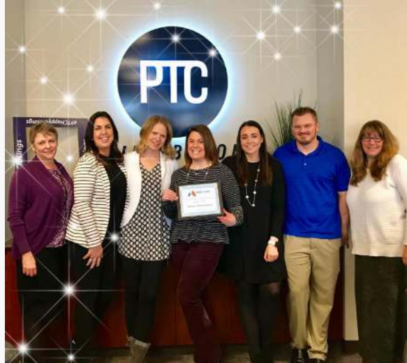
Pioneer Title Company Team